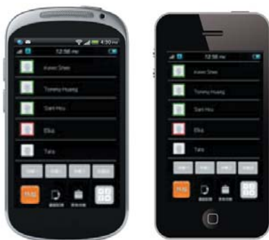
IP3054 App for Android Phone / iPhone