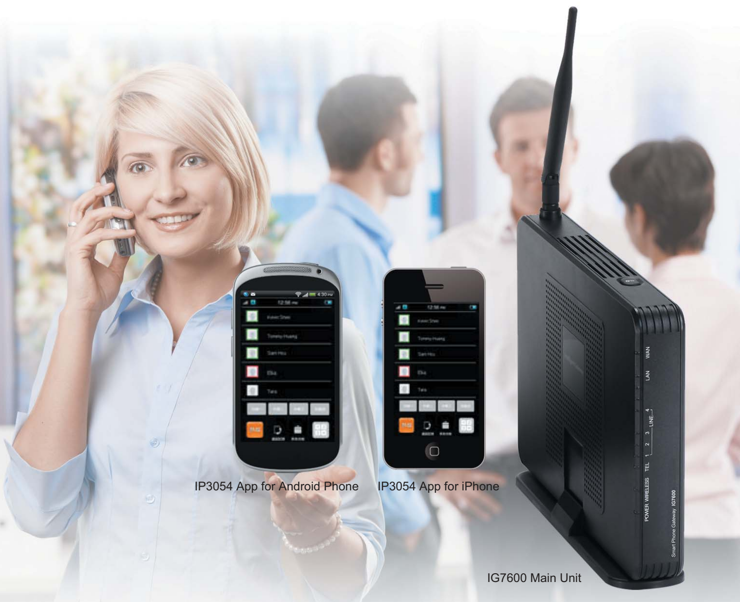
IP3054 App for Android Phone