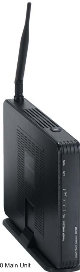
IG7600 Main Unit