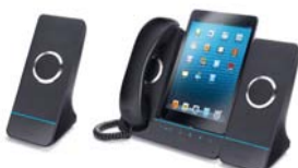
IP3093-L + IP-SPKR